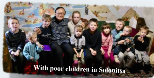
With poor children in Solonitsa