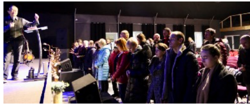
Praying for them during the altar call on Sunday