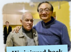
His injured back was totally healed