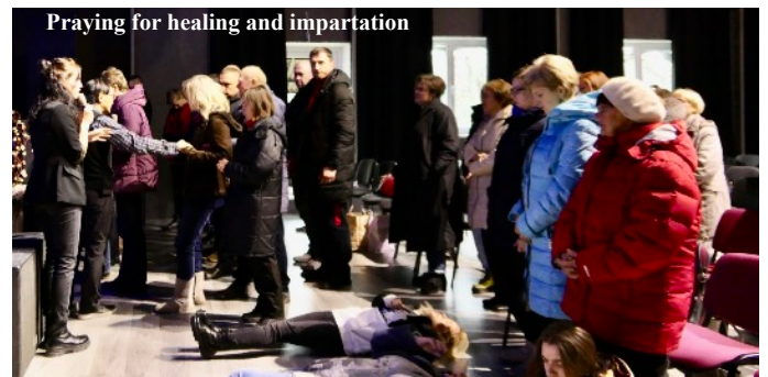
Praying for healing and impartation