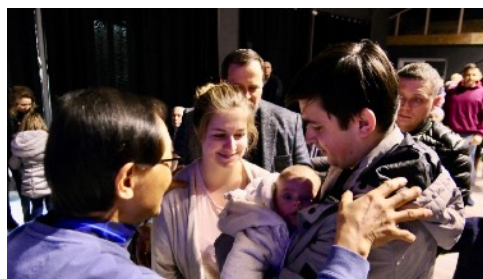
Praying for my spiritual children's first child