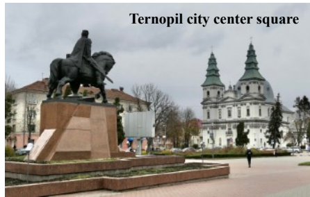
Ternopil city center square