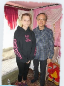
Her injured back was totally healed