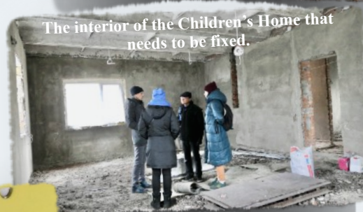
The interior of the Children's Home that needs to be fixed.