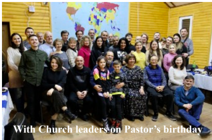
With Church leaders on Pastor's birthday