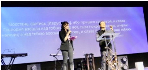
Preaching on Sunday Service