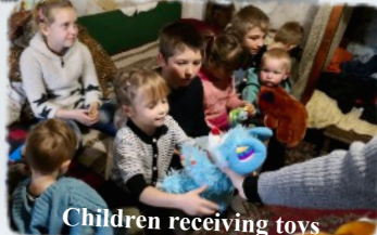
Children receiving toys