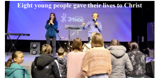
Eight young people gave their lives to Christ