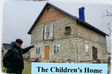
The Children's Home