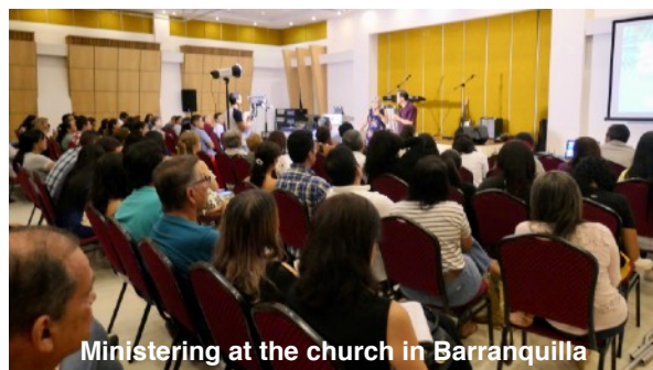
Ministering at the church in Barranquilla