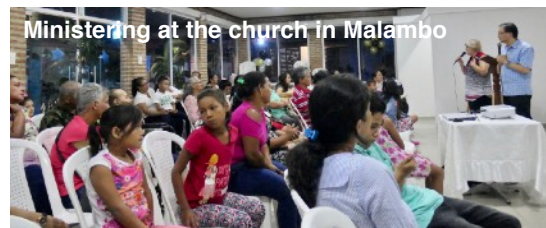
Ministering at the church in Malambo