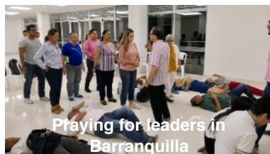
Praying for leaders in Barranquilla