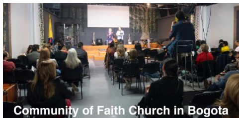
Community of Faith Church in Bogota