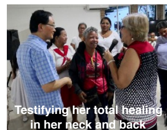
Testifying her total healing in her neck and back