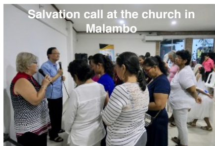
Salvation call at the church in Malambo