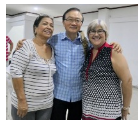
With some of the people who were healed