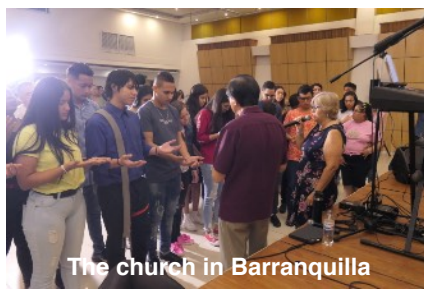
The church in Barranquilla