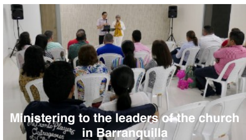
Ministering to the leaders of the church in Barranquilla