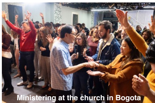
Ministering at the church in Bogota